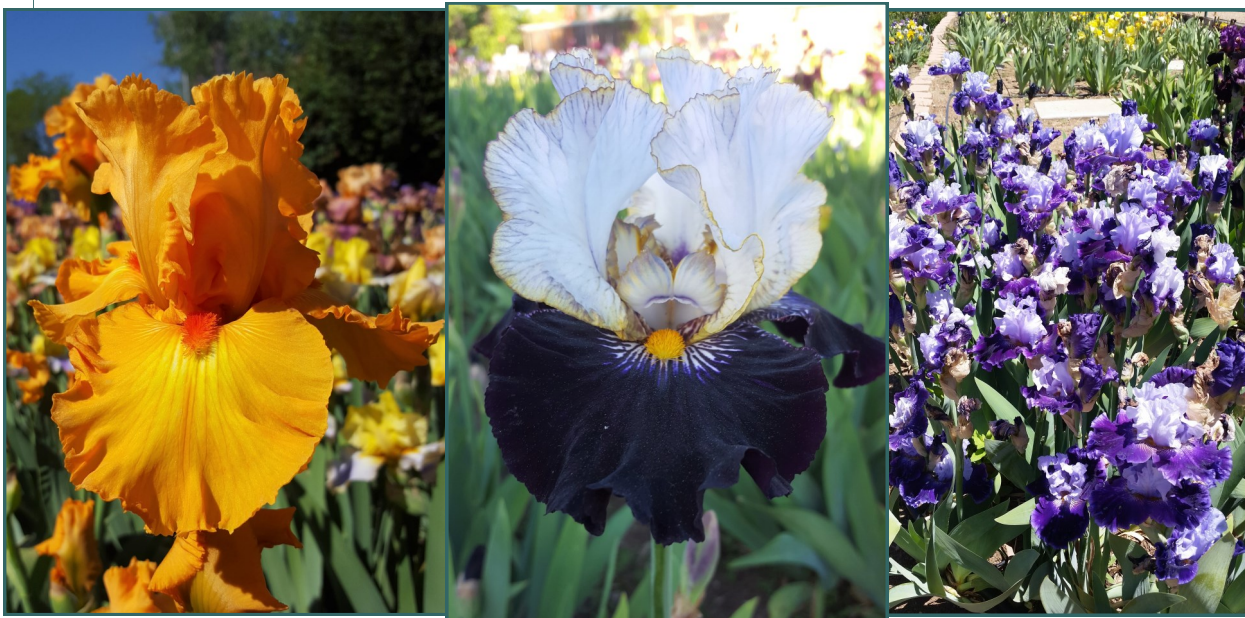
Some Van Liere irises: from left - 2019 introductions 'Orange Crush Cocktail' and 'Darkside of the Moon,' along with 'Global Crossing' (2011) (Hummingbird Iris Garden in Prescott)

Iris4U has expanded to Germany, where Bob's daughter grows irises in a greenhouse and sells the plants at flower markets in Europe, as well as via the internet. - SC