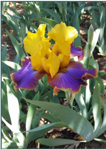
'Crooked Little Smile'

An Affiliate of the American Iris Society